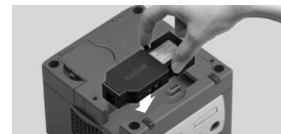
Illustration 2 - Inserting the Broadband Adapter